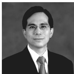
LI, VICTOR T.K. (Non-Independent) Hong Kong Age: 42 Co-Chair Director since August 25, 2000 Common Shares: nil DSUs: nil

Management does not contemplate that any of these nominees will be unable to serve as a director; however, should that occur for any reason, the persons named in the Form of Proxy have the right to vote for another nominee in their discretion, unless the shareholder has directed that the Common Shares be withheld from voting in the election of directors. Each director elected will hold office until the close of the next annual meeting of the Corporation or until his or her successor is elected or appointed.