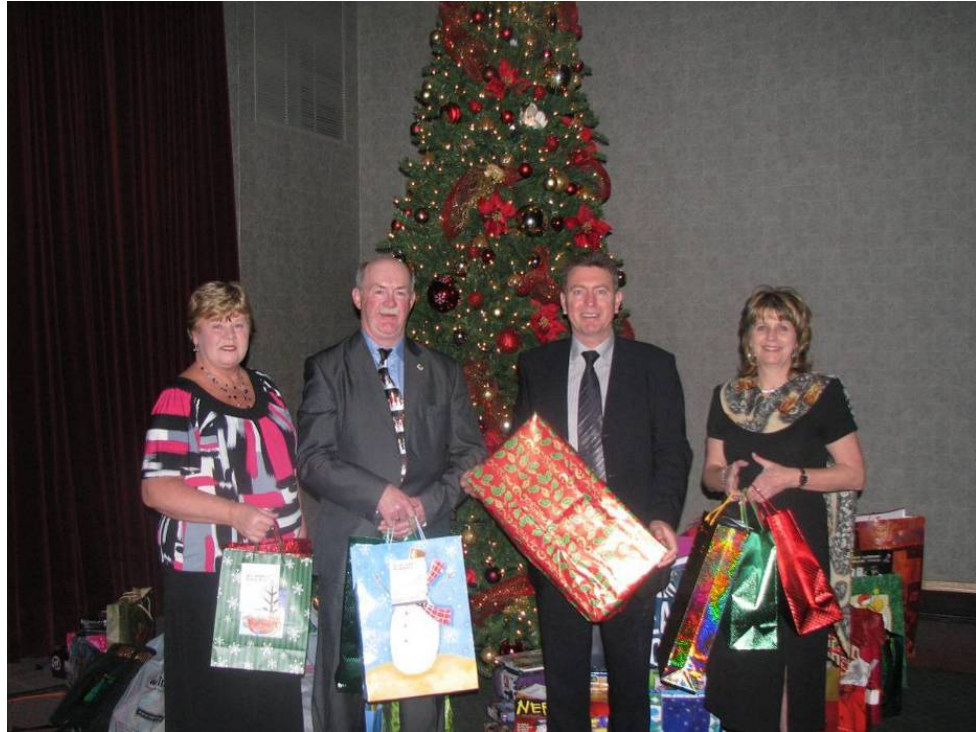
Husky Employees Donate to the VOCM Happy Tree