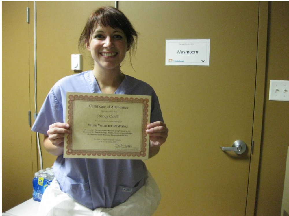
Husky Employees Receive Oiled Wildlife Response Training at the Joint Seabird Rehabilitation Centre in Dec 2009