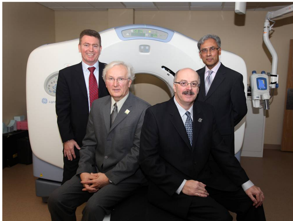
Husky Donates a 4D CT Simulator to the Bliss Murphy Cancer Clinic December 2009