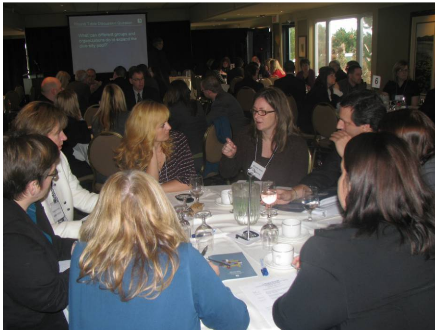
Round Table Discussions on Building the Diversity Pool Husky Energy Diversity Forum November 18, 2009