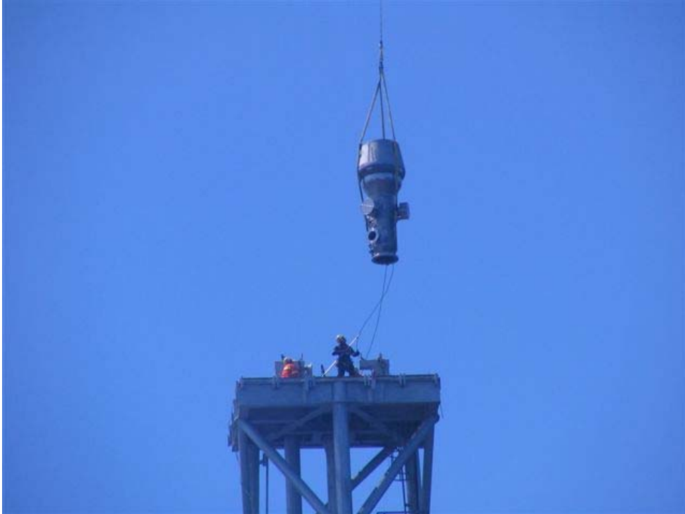
Change out of the Flare Tip during the Maintenance Turnaround onboard the SeaRose FPSO in July 2007