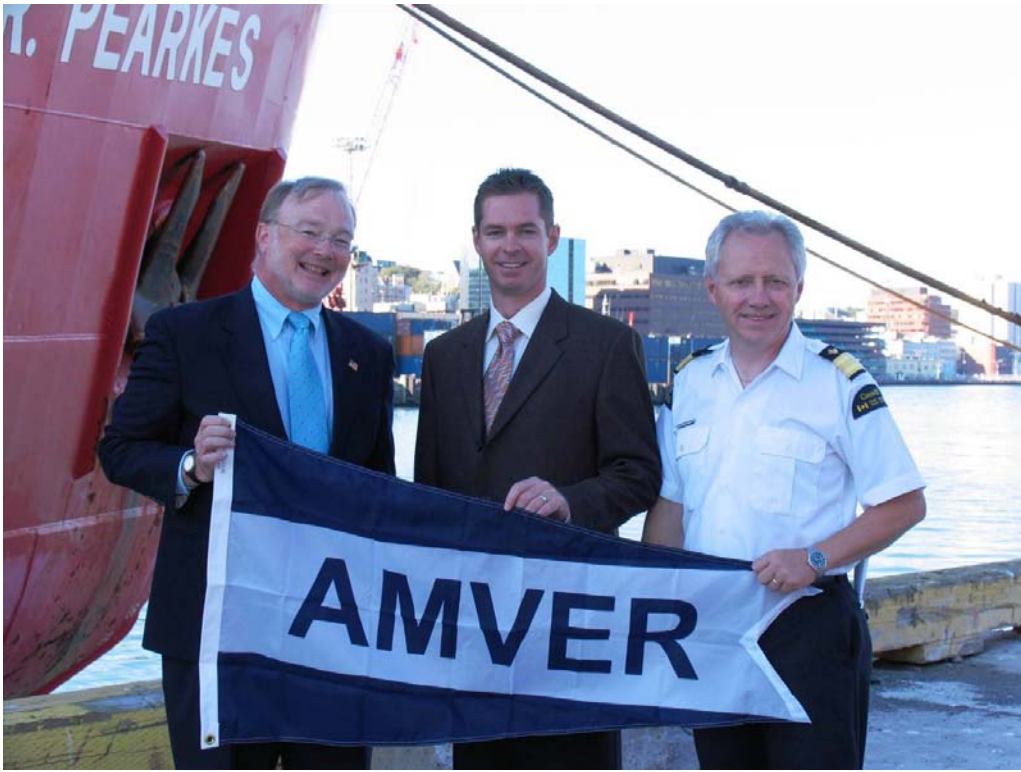
Husky is Presented with the AMVER Award By the Canadian Coast Guard