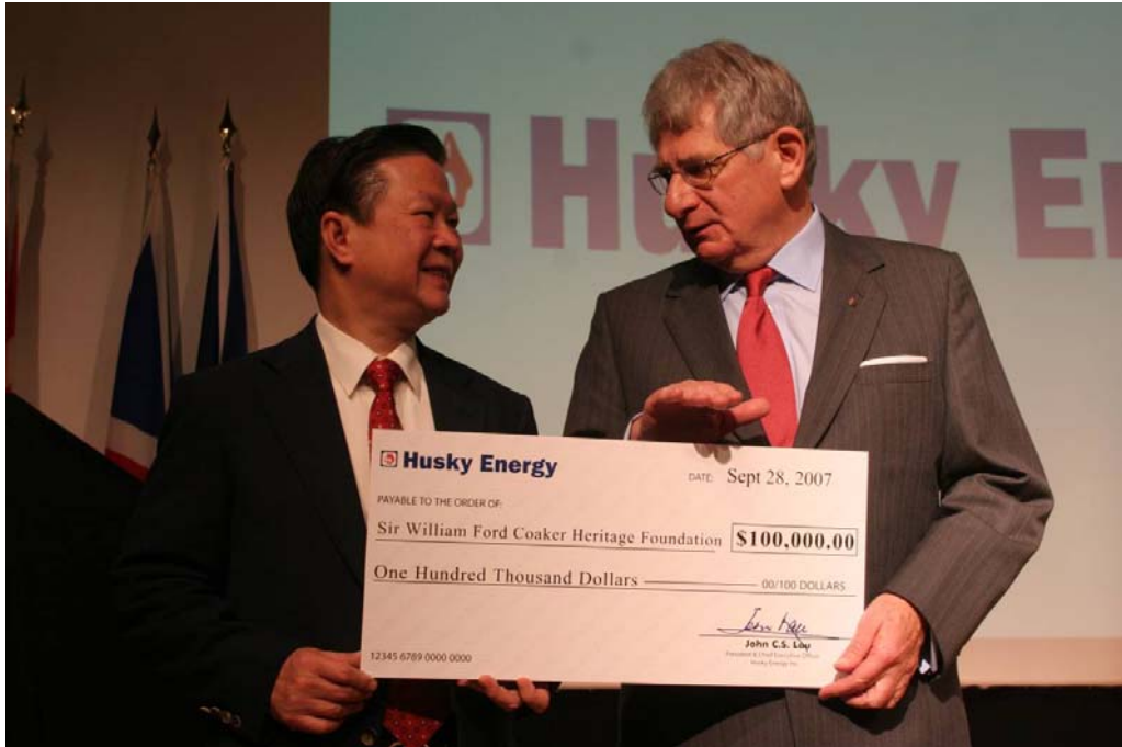
Husky Contributes $100,000 to the Sir William Ford Coaker Heritage Foundation September 28, 2007