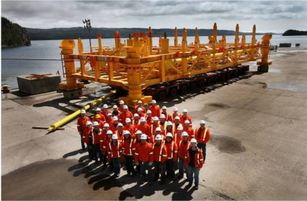
Site Team at Bull Arm