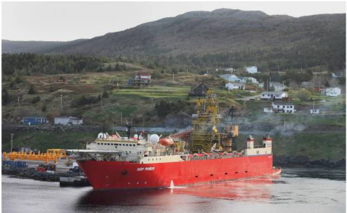
Deep Pioneer Lay Vessel in Bay Bulls