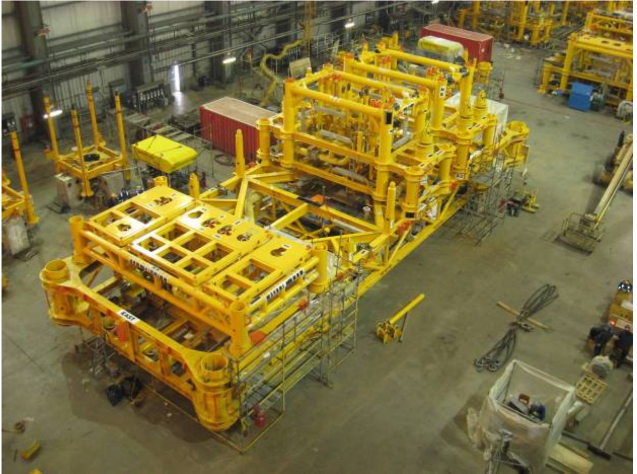
Main Support Frame 2 with modules and roof in at Bull Arm