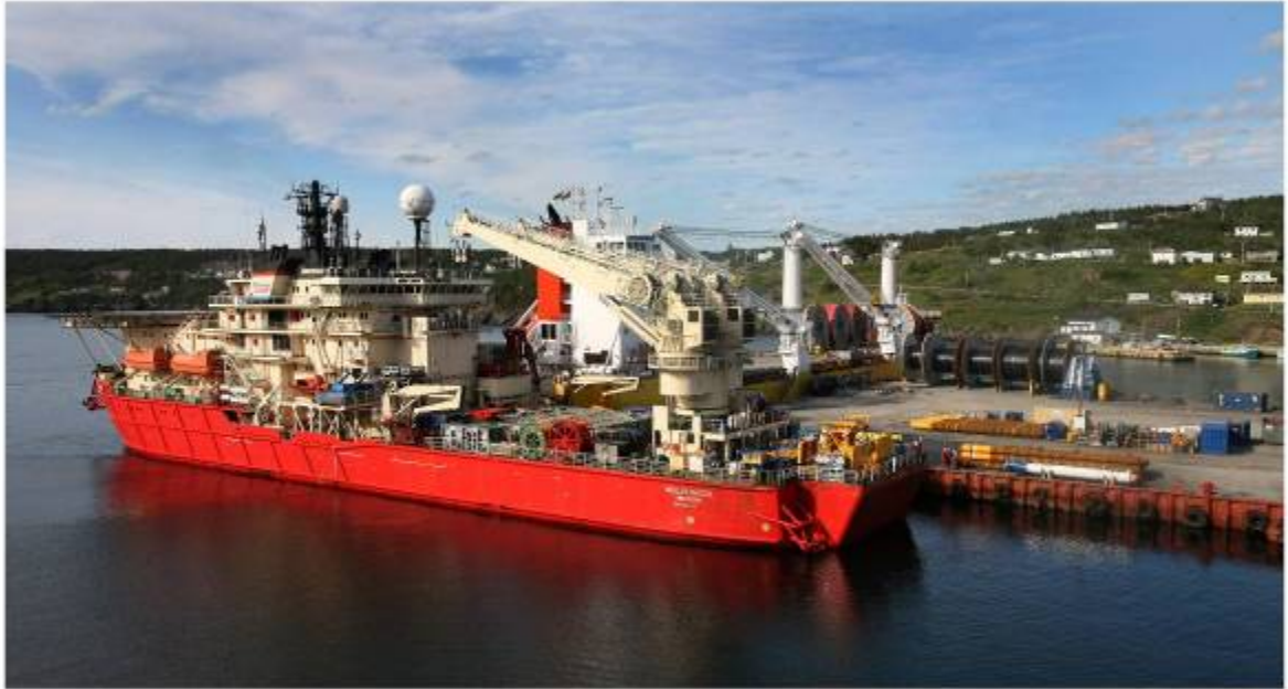
Well Service diving support vessel in Bay Bulls