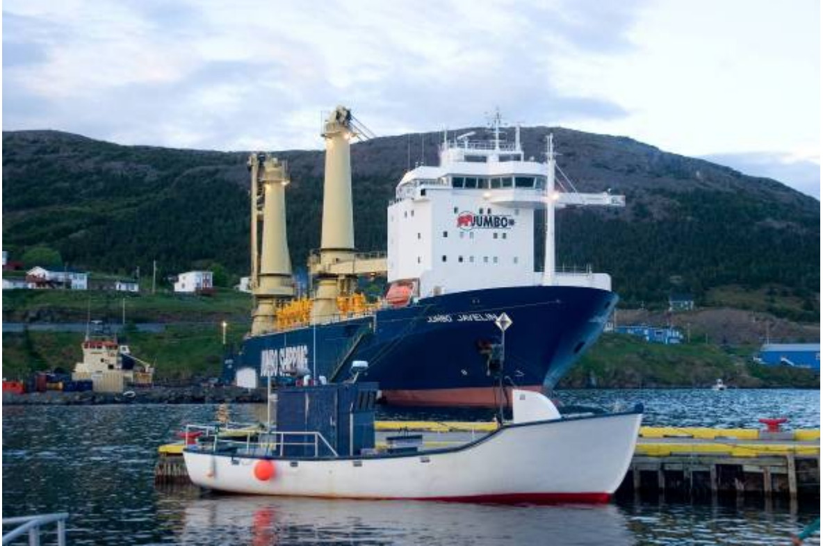
Jumbo Javelin Heavy Lift Vessel in Bay Bulls