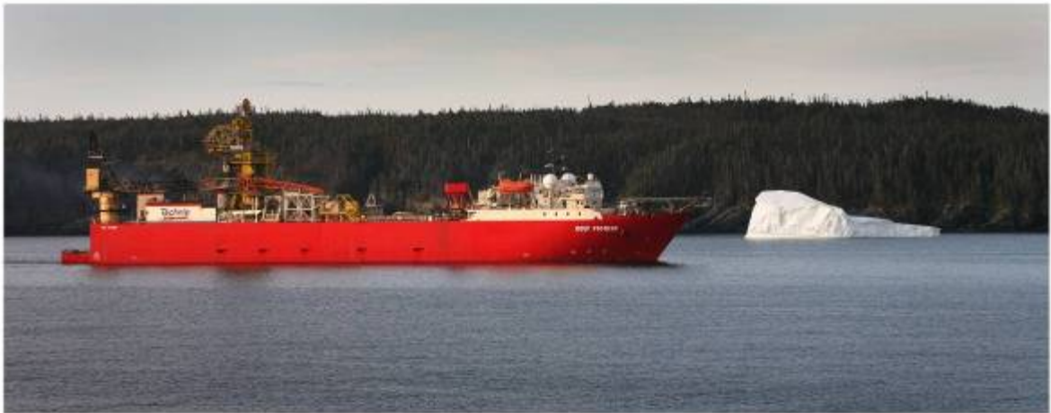
Deep Pioneer Departing Bay Bulls for White Rose Field