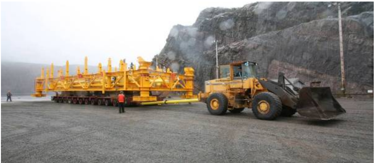
Loadout of MSF from the Assembly Hall