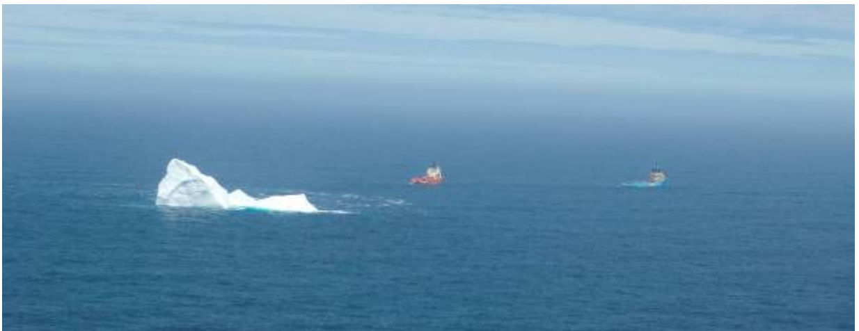
Ice Management on the White Rose Field in April 2009