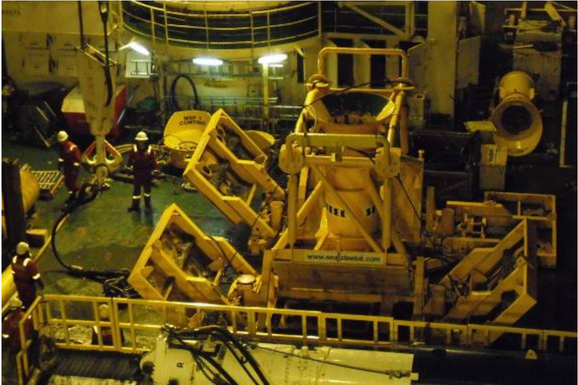
Fast Frame on Deck of Deep Pioneer