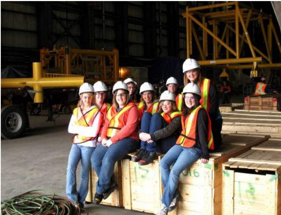
Grade Nine Girls from Arnold's Cove Tour the Bull Arm site as part of Techsploration