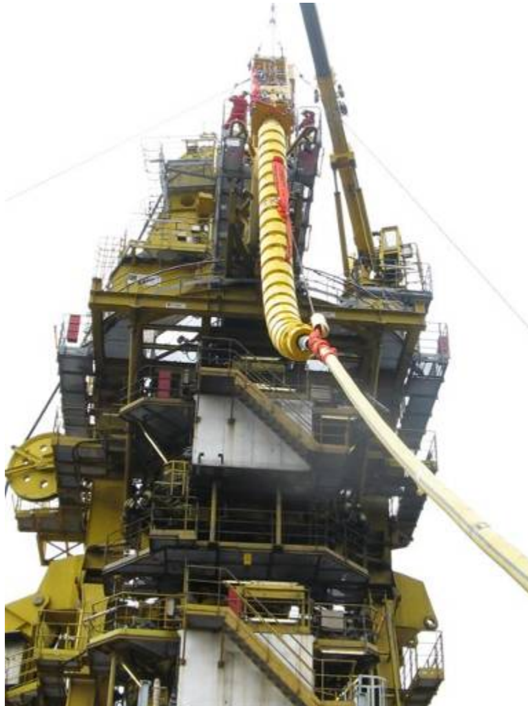
Installation of Flowlines in the North Amethyst Field